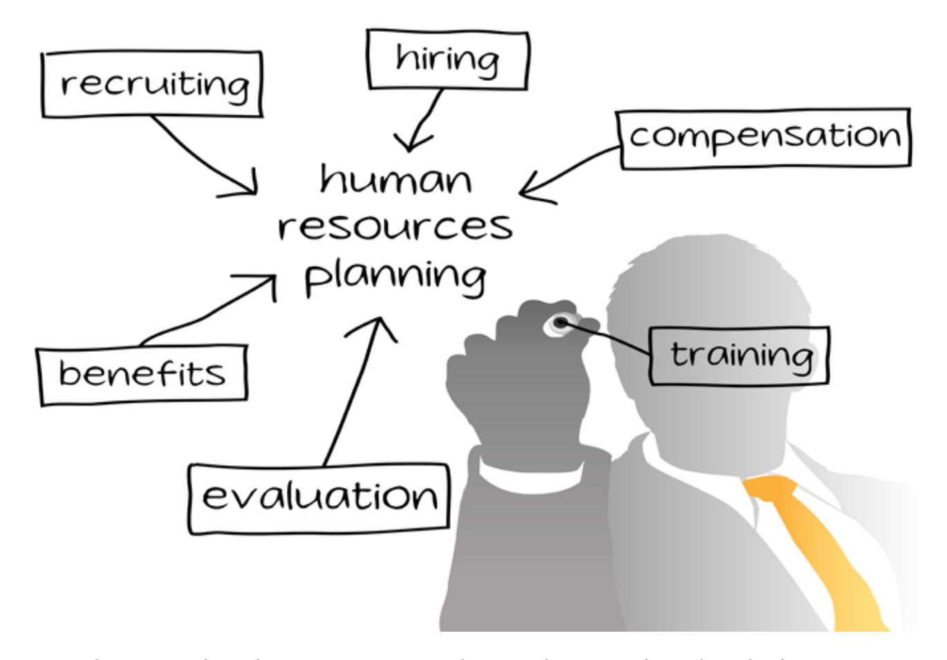
Page 6 Goodmans eBooks - Alternative Dispute Resolution; Why It Doesn't Work and Why It Does

Kenya: Not less than 15 days' pay for each completed year of service